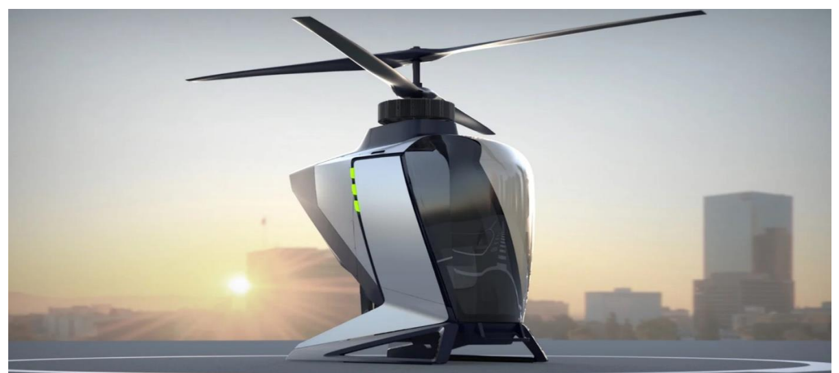
Figure 6. Urban air mobility vehicle [11]

Another mode that was not present in the past and is gaining some momentum is urban air mobility. Effectively, many companies started with some prototypes back in 2021, like FlyNow, Airbus, and Varon Vehicles. This mode is environmentally friendly with minimal energy consumption and zero emissions, and it provides a service at a relatively low price for inner-city trips up to a limit of 15 to 50 km. This low price is achieved through the low operational and vehicle costs with the advancements in technology. The vehicles are operated in a way to minimize noise pollution in the urban environment: less than 55 dB are generated at an altitude of 150 m [11].