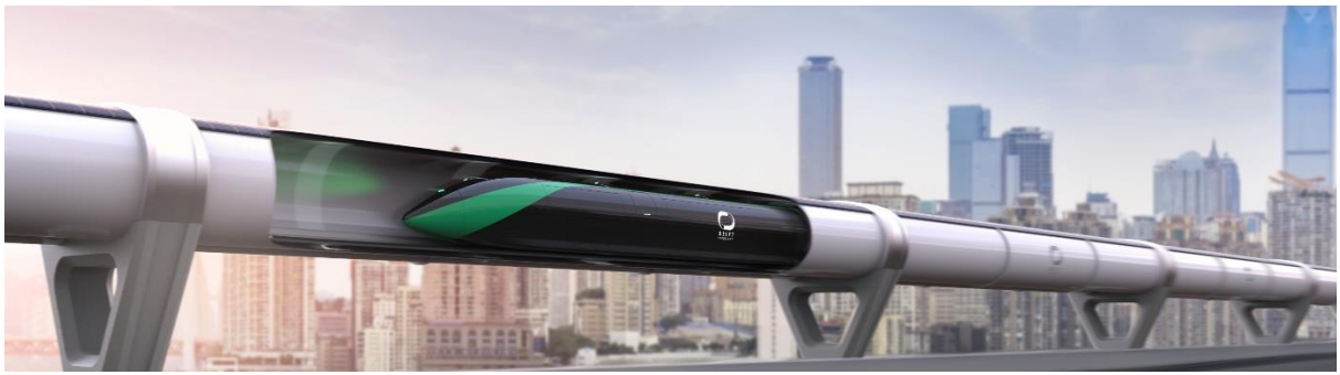
Figure 8. Hyperloop tubes [20]

It was determined to locate the hyperloop hubs between highly used origin-destination cities to provide a competitive mode of international travel. The different modes mentioned previously constitute a more detailed network compared to the coarser hyperloop network. Effectively, the Netherlands houses few stations located in the main cities like Amsterdam and Den Haag. Passengers use this mode to travel to other cities all around Europe in minimal time. What was unimaginable 30 years ago is now a reality: you can meet a friend in Paris in the morning and come back to Amsterdam for lunch. Passengers are able to use the other modes presented to access the hyperloop hubs. The hyperloop concept lies in coordination with the on-demand culture where the pods are filled with 28 to 50 passengers, and head towards the desired city with no stops or any transfers. The pods have effectively limited capacity compared to traditional trains; however, the main advantage is the high frequency that could be achieved. Effectively, the high communication connectivity of the system and automated operation allows keeping very low headways between pods and achieve frequencies of 2 pods per minute [20].