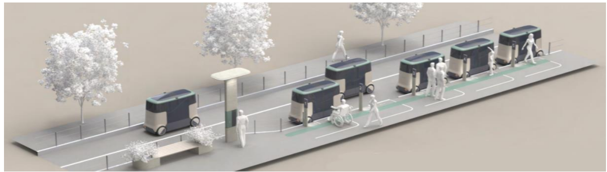
Figure 5. Rendering of busy SAVs station [9]

An important barrier to SAV adoption was the presence of an attendant, both due to government regulations and traveler perceptions. For SAVs to be cost-effective, vehicles should be monitored remotely, but prior to their implementation, studies showed that the majority of travelers would not use them because they did not feel comfortable without an attendant [8]. To help travelers adjust to this new mode, there was a transition where attendants were on-board the SAVs until travelers became confident with the technology. Once the government and the traveling public were confident in the technology, regulations requiring an attendant were relaxed and SAVs became truly autonomous.