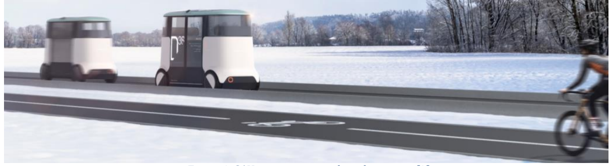
Figure 3. SAVs integration in the urban space [9]

Shared autonomous vehicles (SAVs) have various roles in today's mobility, with different uses in urban, suburban and rural areas. Some hurdles had to be overcome in order to implement them, specifically the technology development and the regulations surrounding it. The first SAVs were a completely automated road-based form of transport having a small physical size and capacity, with no regular interaction of the user with the driving tasks [8]. These first SAVs were electric and were limited by speed, travel range, and size, and only ran on dedicated infrastructure that was separate from other modes. However, in order to play a role in the mobility of the Netherlands, these limitations had to be overcome. Luckily, private companies were very interested in investing in this technology, and this innovation led to the eventual creation of new generation vehicles that could travel at higher speeds (in permitted areas), operate for longer distances due to improved battery technology, and provide a range of capacities depending on the demand. Higher speeds and longer distances allowed SAVs to expand beyond their previous sole use as an access and egress mode and allowed this mode to permeate into all areas of the Netherlands.