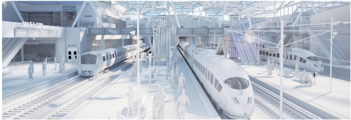
Figure 7. Rendering of a train station [15]

Rail travel within the Netherlands has not changed too much in the past 30 years, but some changes were implemented to accommodate the increase in travel demand. Travelers who previously used a personal vehicle had to switch to a new mode for long-distance travel within the country, which in this case is heavy rail. Here we distinguish between the main line network, regional network, and local networks within large cities.